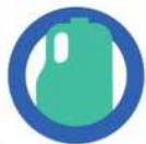
Plastic containers, jugs, bottles